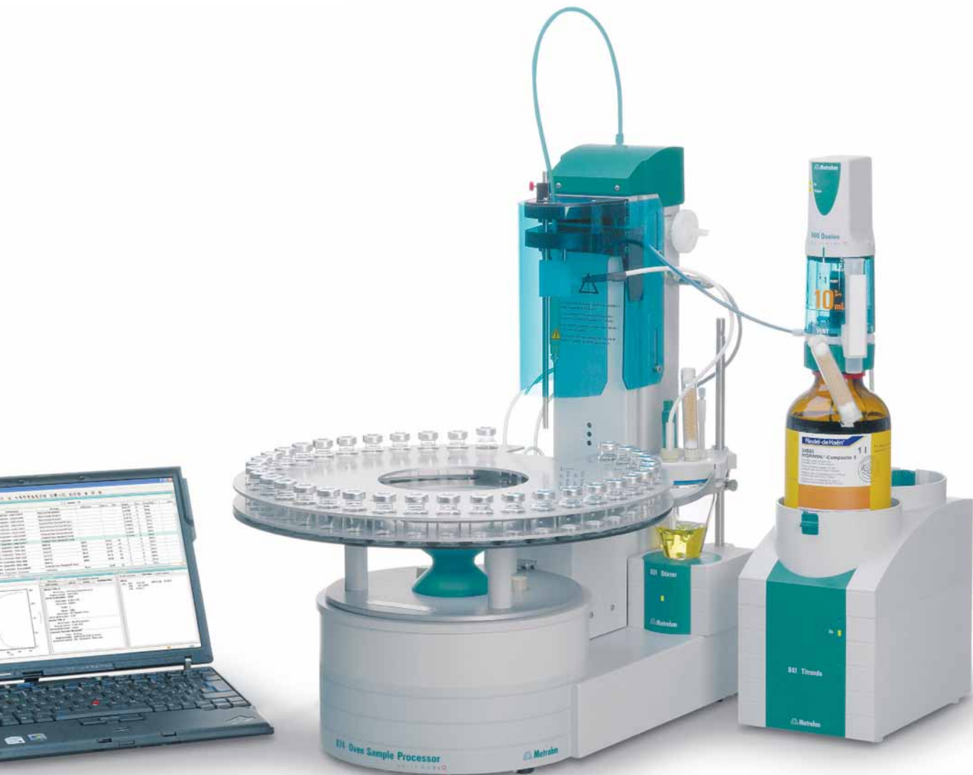
Volumetric titration – 874 USB Oven Sample Processor with 841 Titrand