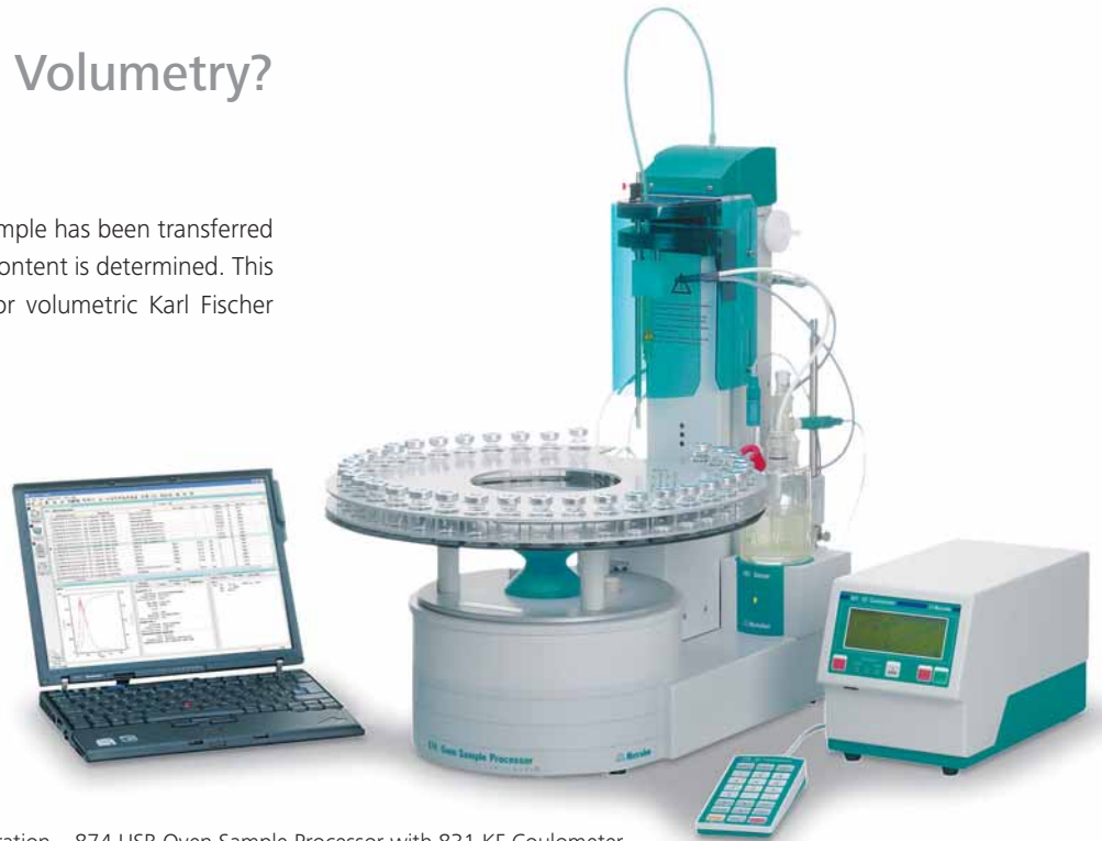
Coulometric titration – 874 USB Oven Sample Processor with 831 KF Coulometer

Once the moisture from the sample has been transferred to the titration cell, the water content is determined. This can be done by coulometric or volumetric Karl Fischer titration.