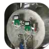
Separate steam generator