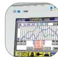
Graphic cycle display