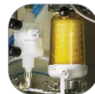
Decontamination of exhaust air with sterile filter