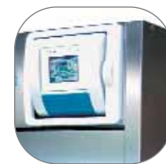
Color touchscreen with synoptic display