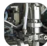
Sanitary diaphragm valve in 316L stainless steel with pneumatic actuator for maximum reliability and tightness.