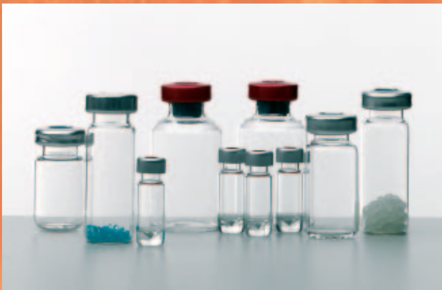
Various sizes of sample vials can be used for analyses with the 832 KF Thermoprep.

Subject to modifications Printed in Switzerland by Metrohm Ltd., Herisau 8.832.6003 - 2002-12