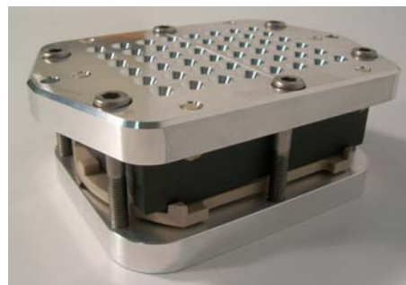
Fig. 2. Assembled Well Plate

To simplify accurate positioning of all the components, the base and top plate are equipped with appropriate guiding bolts. Thus, the SiC well plate rests correctly on the base and the top plate can be placed straight on the well plate. Crosswise fixing of the six screws with an Allen key ensures plain sealing without any torsion. The assembled unit is shown on Fig. 2, a detailed description of the set-up is presented in the brief instruction manual (C49IB09).